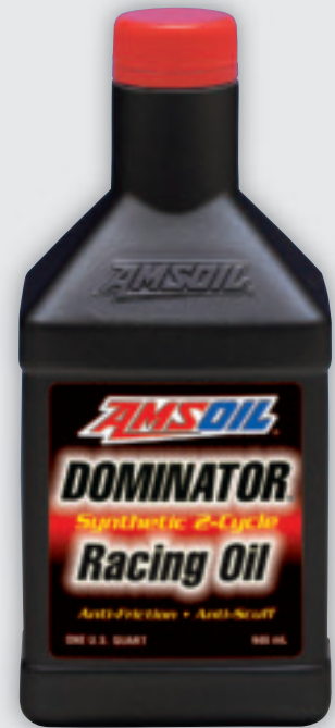
JASO FC • API TC